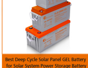
Best Deep Cycle Solar Panel GEL Battery for Solar System Power Storage Battery