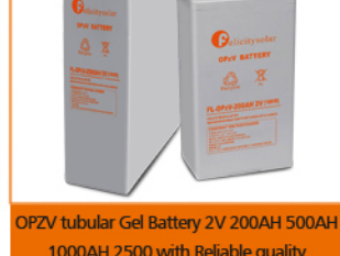
OPzV tubular Gel Battery 2V 200AH 500AH 1000AH 2500 with Reliable quality