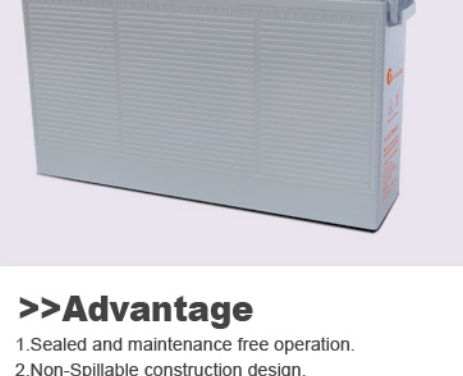
4.terminal protective cover