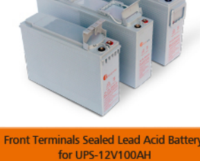
Front Terminals Sealed Lead Acid Battery for UPS-12V100AH

OPzV Solar gel battery 200Ah 500Ah 1000Ah 2500Ah 2V