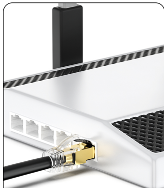
Connect the router