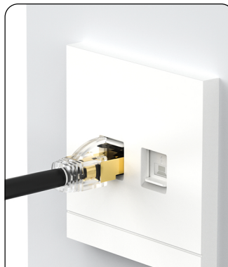
Connect to network panel